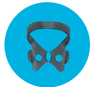
Rubber Dam Clamps