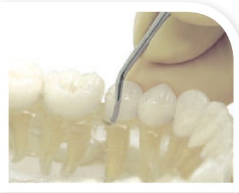
DISTAL LEFT SECOND PREMOLAR