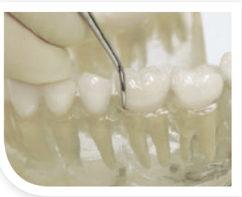
MESIAL LEFT FIRST MOLAR