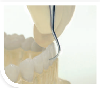
MESIAL LEFT CENTRAL INCISOR