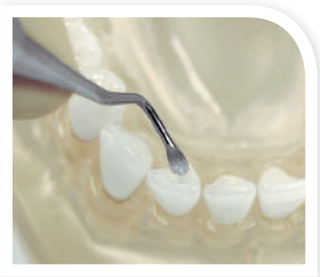
LINGUAL LEFT LATERAL INCISOR