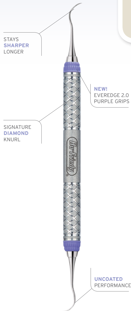
4 NEVI® POSTERIOR SCALER SCNEVI49E2

Each Nevi instrument was created from a combination of customer feedback and Hu-Friedy's tradition of quality, innovation and skill. The unique angles and distinct characteristics of each Nevi allow for access and reach into difficult areas, while our EverEdge® 2.0 Technology keeps the instruments sharper longer – adding up to a more efficient, comfortable scaling experience.