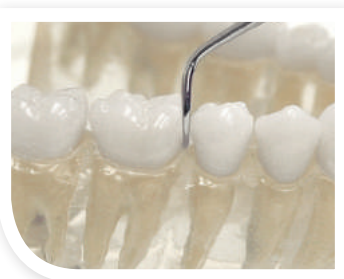
MESIAL RIGHT FIRST MOLAR