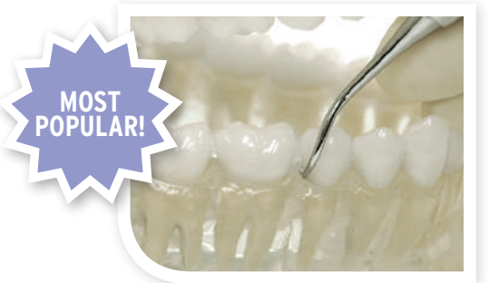
MESIAL RIGHT FIRST PREMOLAR