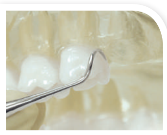
DISTAL LEFT SECOND MOLAR