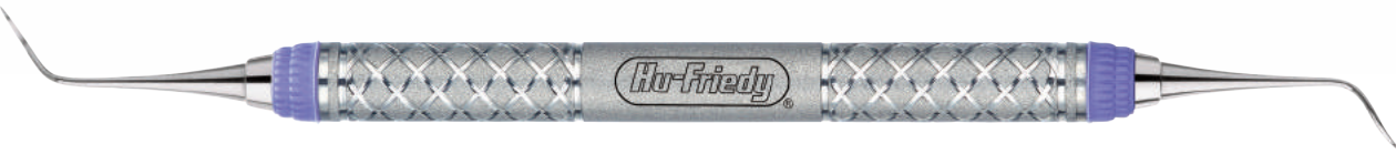
NEVI® 2 | SCNEVI29E2