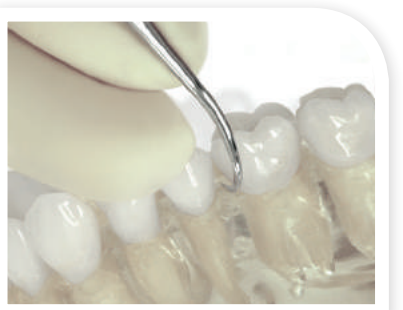
DISTAL RIGHT SECOND MOLAR