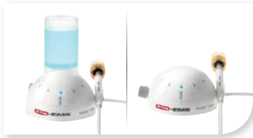
Piezon® 250 FT-224#HF/A/001