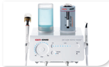
AIR-FLOW Master Piezon | FT-200#HF/A/001

All three technologies in one unit! The ultimate prophylaxis device combines Piezon ultrasonic scaling with AIR-FLOW and PERIO-FLOW for polishing and biofilm management treatments