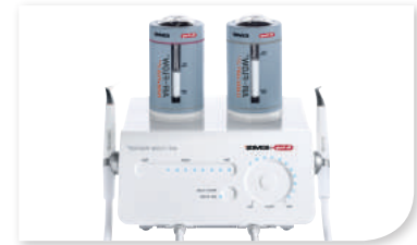
AIR-FLOW Master | FT-188#HF/A/001

All three technologies in one unit! The ultimate prophylaxis device combines Piezon ultrasonic scaling with AIR-FLOW and PERIO-FLOW for polishing and biofilm management treatments