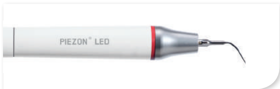
Piezon LED handpiece | EN-060#HF/A