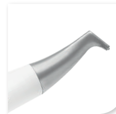
Handy 3.0 Plus handpiece EL-545#HF/A