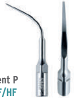
Instrument P DS-011HF/HF

For moderate to heavy supragingival deposits