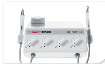
AIR-FLOW S2 | FT-178#HF/A/001

Same great features of AIR-FLOW S1 combined with Piezon technology for comfortable, effective ultrasonic scaling