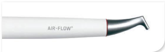
AIR-FLOW handpiece | EL-308#HF/A Handy 3.0 handpiece | EL-540#HF/A