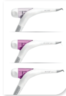
AIR-FLOW® handy 3.0 | FT-220#HF/A/00x AIR-FLOW handy 3.0 PERIO | FT-221#HF/A/00x AIR-FLOW handy 3.0 PREMIUM | FT-225#HF/A/00x [x: 1 = Midwest; 2 = Kavo; 3 = W&H; 4 = NSK; 5 = Bien Air; 6/12 = Sirona]