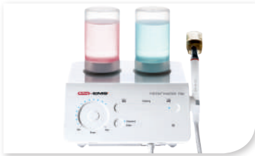
Piezon Master 700 | FT-194#HF/A/001