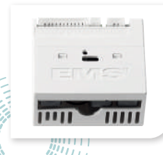
Piezon 707 Built-in Kit FS-435HF, FS-446HF (A-dec 541 only)