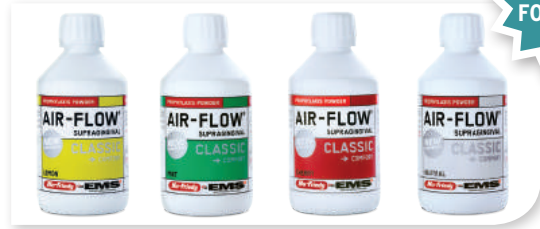
CLASSIC Lemon DV-1001 CLASSIC Mint DV-1010 CLASSIC Cherry DV-1006 CLASSIC Neutral DV-1009