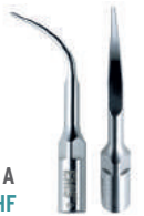
Instrument A DS-001HF/HF

For moderate to heavy supragingival deposits