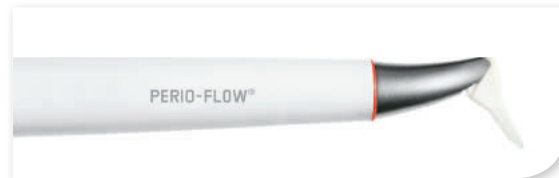
PERIO-FLOW handpiece | EL-354#HF/A Handy 3.0 PERIO handpiece | EL-542#HF/A