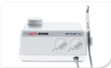
AIR-FLOW S1 | FT-177#HF/A/001