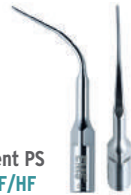
Instrument PS DS-016HF/HF

For light to moderate supragingival deposits and subgingival use up to 4mm where access permits