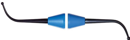
SkoolToolz 3, Curved Ball Burnisher TNTAM3